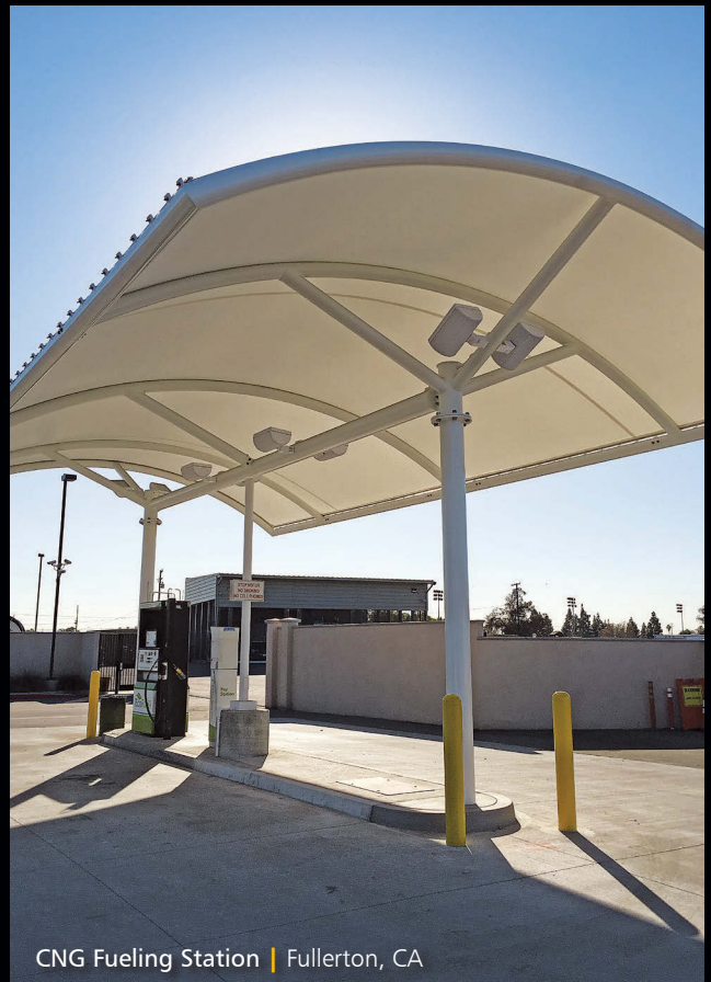
CNG Fueling Station | Fullerton, CA