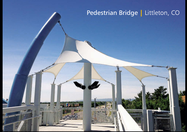
Pedestrian Bridge | Littleton, CO

We specialize in design, manufacturing and installation of structurally complex and creatively challenging commercial, government and prototype design projects regardless of job size, scope of work or administrative demands. Eide welcomes all projects that include participation and compliance with FAR, DIR, OATELS / Apprenticeship Program, Prevailing Wage, Union Labor Agreement and any additional Project Specific requirements.