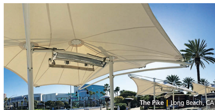
The Pike | Long Beach, CA