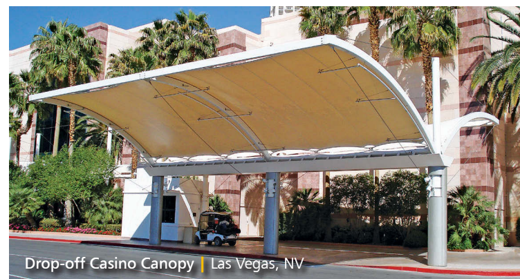
Drop-off Casino Canopy | Las Vegas, NV