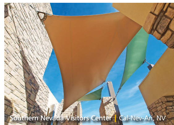
Southern Nevada Visitors Center | Cal-Nev-Ari, NV