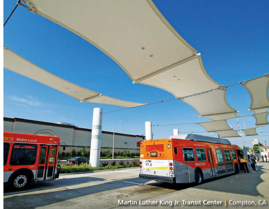
Martin Luther King Jr. Transit Center | Compton, CA