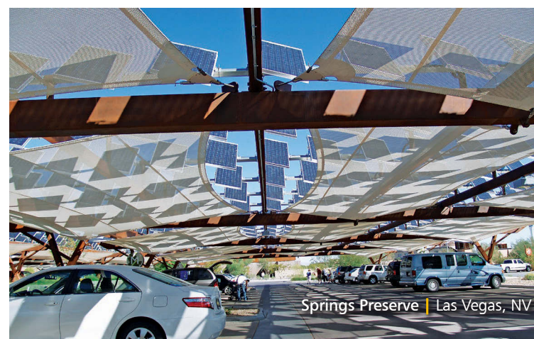
Springs Preserve | Las Vegas, NV

When you're traveling at an airport or standing at a bus stop, having protection from the weather is important for any commuter. Tension fabric structures are not only functional shading products and weather barriers with the ability to span long distances with minimal structural support, but they also allow architects and designers to experiment with form and shape to create exciting signature projects.