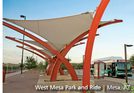
West Mesa Park and Ride | Mesa, AZ