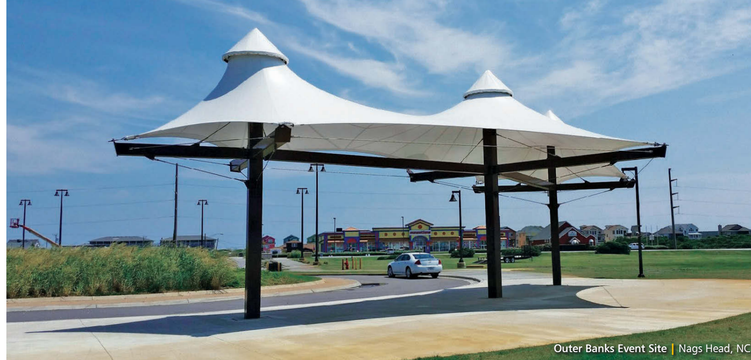
Outer Banks Event Site | Nags Head, NC