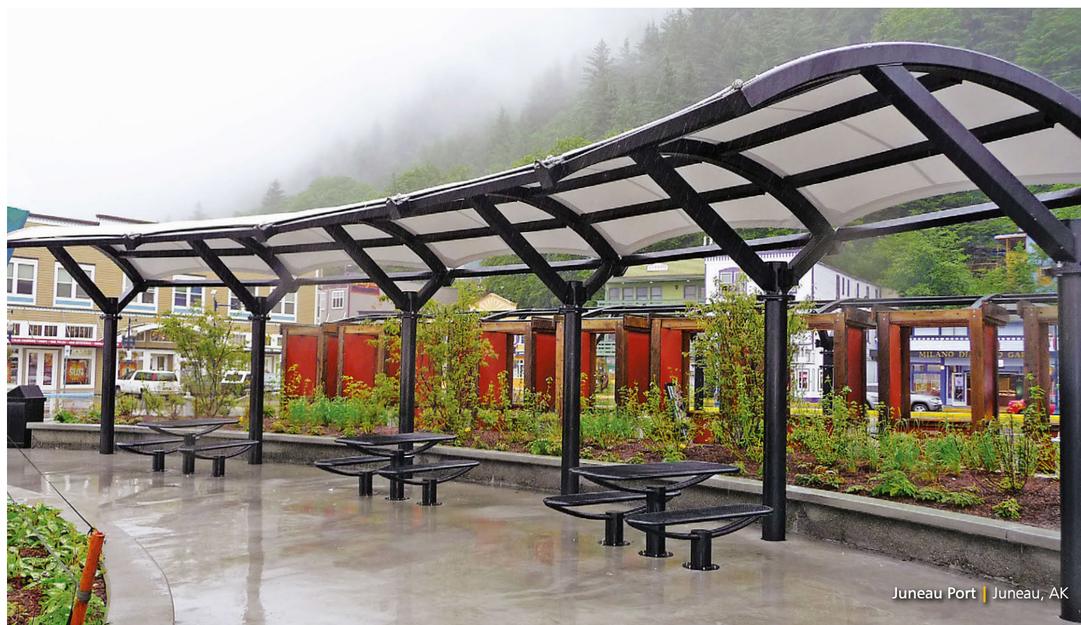
Juneau Port | Juneau, AK