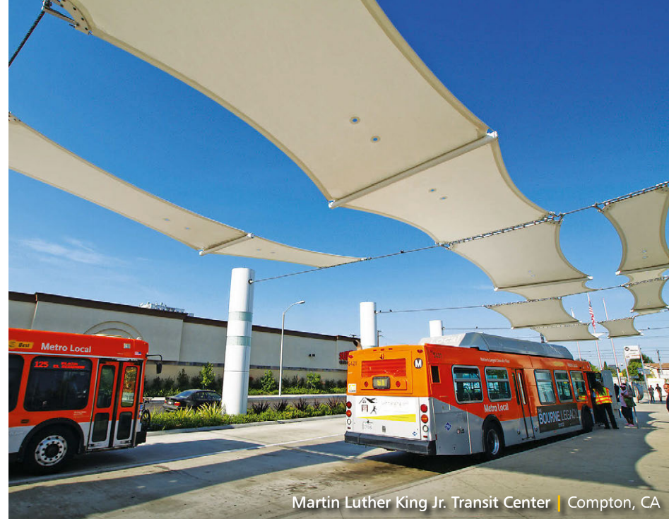
Martin Luther King Jr. Transit Center | Compton, CA