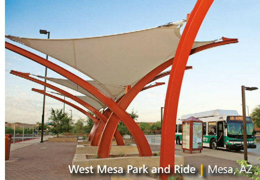
West Mesa Park and Ride | Mesa, AZ