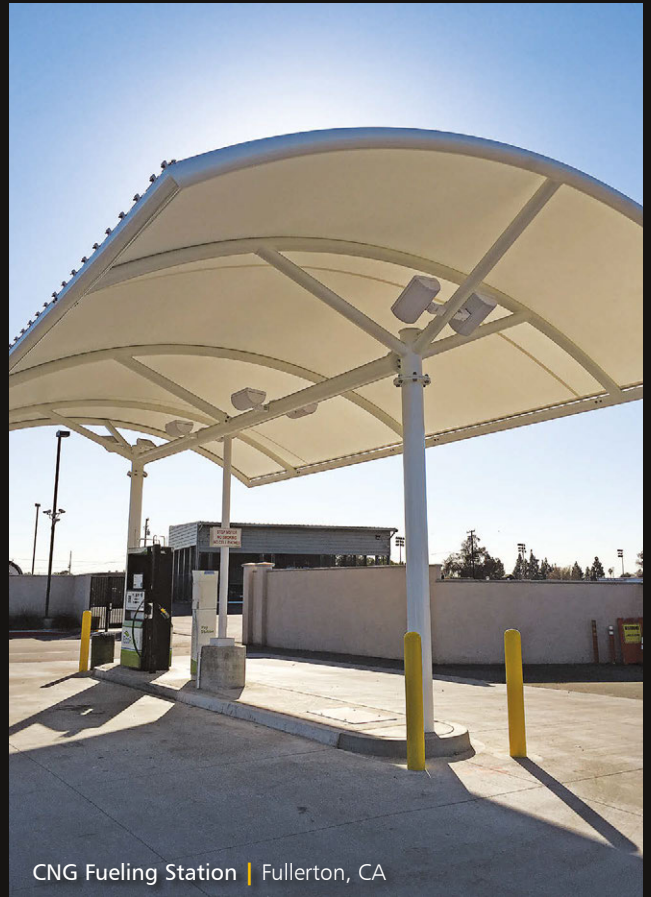
CNG Fueling Station | Fullerton, CA