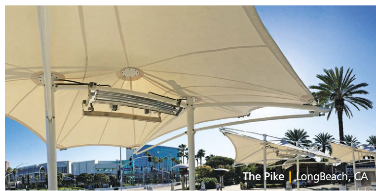
The Pike | Long Beach, CA