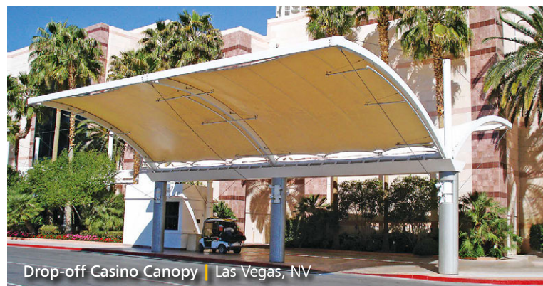
Drop-off Casino Canopy | Las Vegas, NV