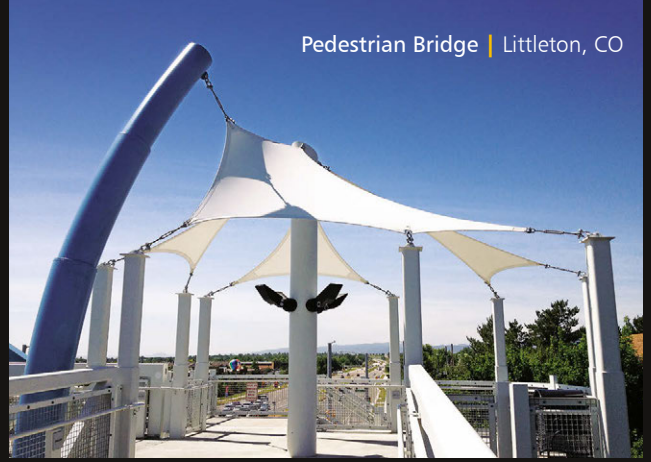
Pedestrian Bridge | Littleton, CO

We specialize in design, manufacturing and installation of structurally complex and creatively challenging commercial, government and prototype design projects regardless of job size, scope of work or administrative demands. Eide welcomes any opportunity to partner with projects that require compliance with FAR, DIR and OATELS, Prevailing Wages, Apprenticeship Programs, and Union Labor Agreements.