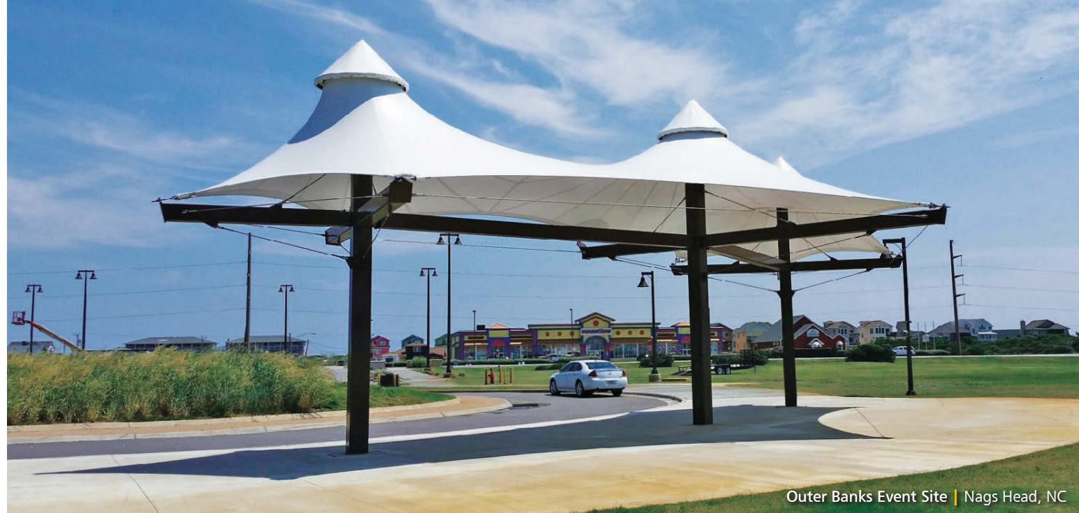
Outer Banks Event Site | Nags Head, NC