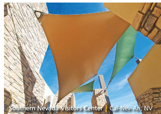
Southern Nevada Visitors Center | Cal-Nev-Ari, NV