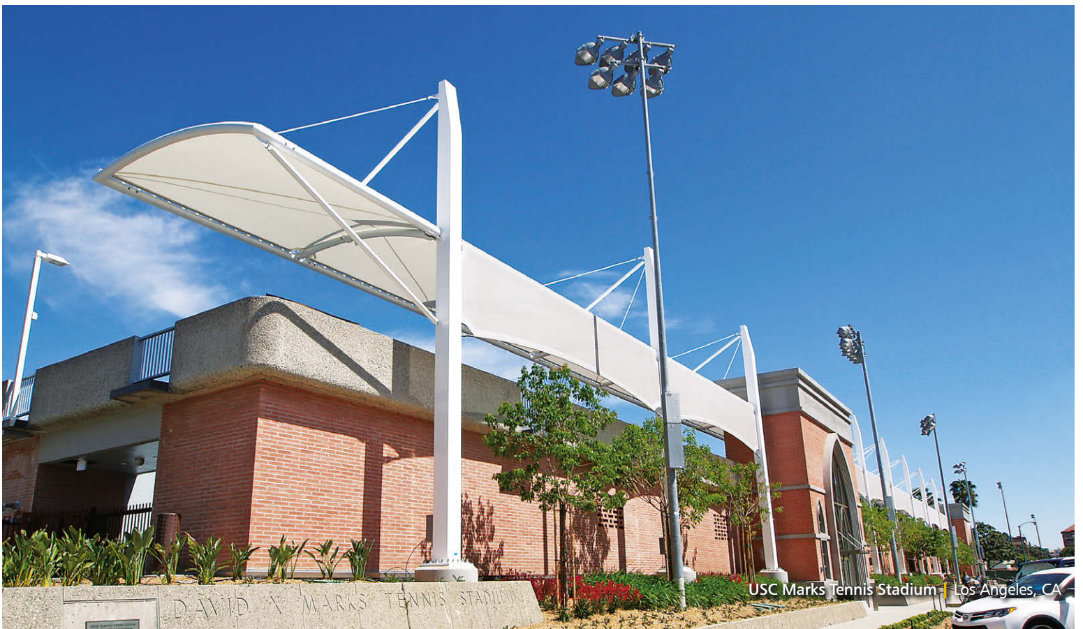
USC Marks Tennis Stadium | Los Angeles, CA