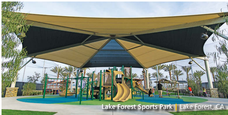
Lake Forest Sports Park | Lake Forest, CA