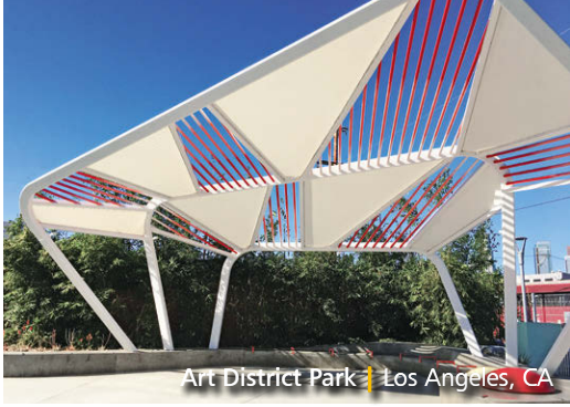
Art District Park | Los Angeles, CA