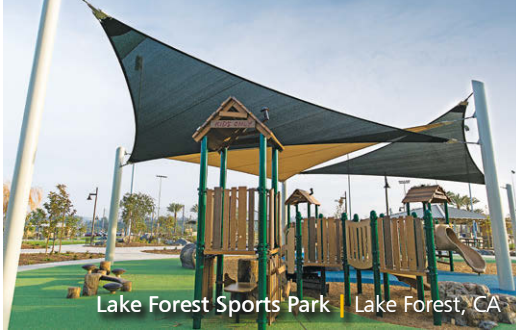
Lake Forest Sports Park | Lake Forest, CA