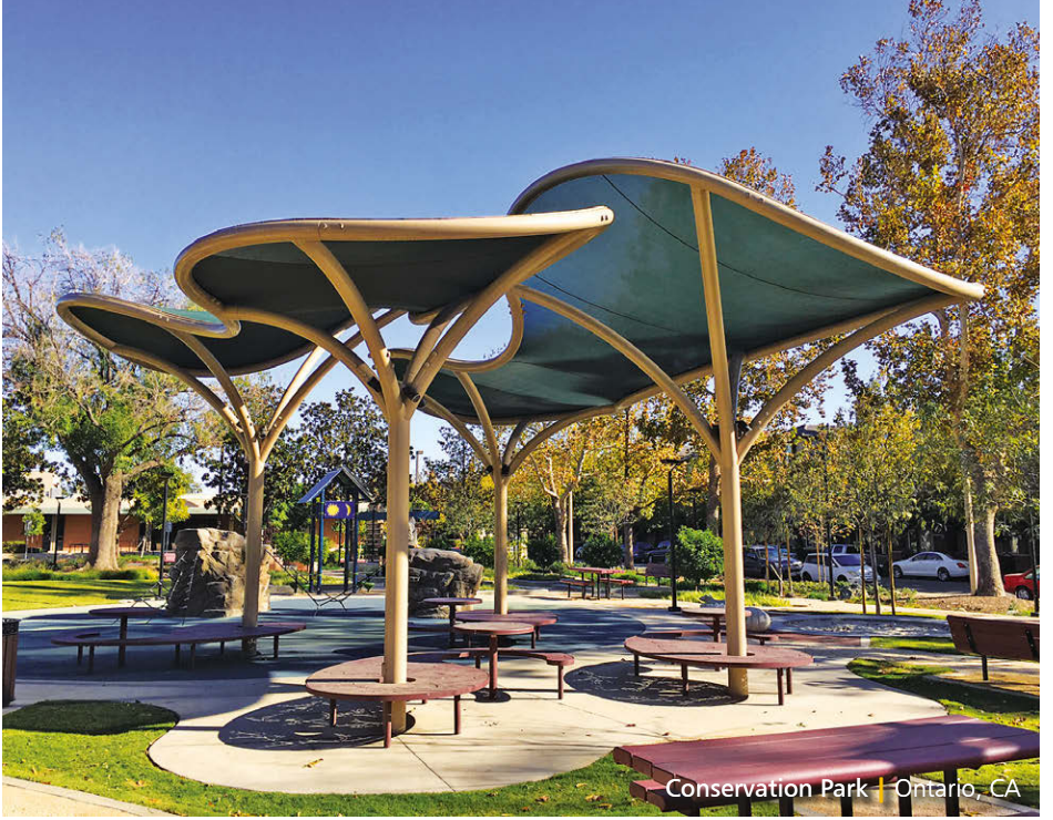
Conservation Park | Ontario, CA