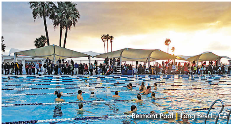
Belmont Pool | Long Beach, CA