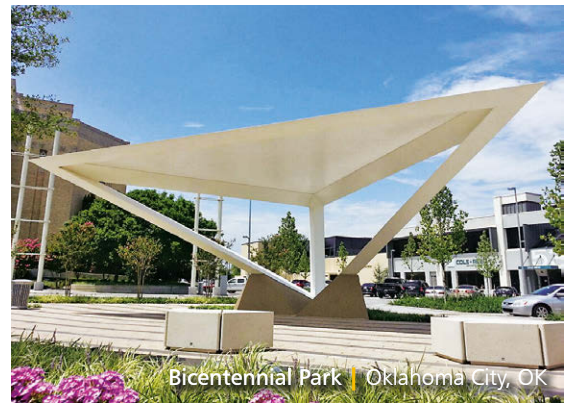
Bicentennial Park | Oklahoma City, OK