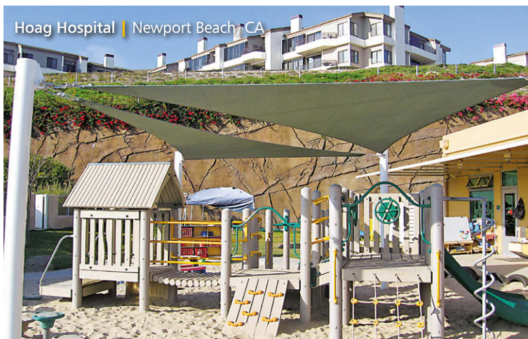
Hoag Hospital | Newport Beach, CA

When you're a spectator watching a sporting event or kids playing around at a playground, tension fabric structures are effective solutions for shade protection from harmful UV rays or shelter from inclement weather. While new trees may take decades to provide adequate shade, a tension fabric structure can perform immediately and eliminate years of uncomfortable sun exposure.