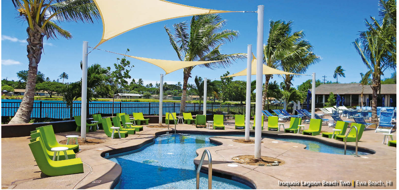
Iroquois Lagoon Beach Two | Ewa Beach, HI