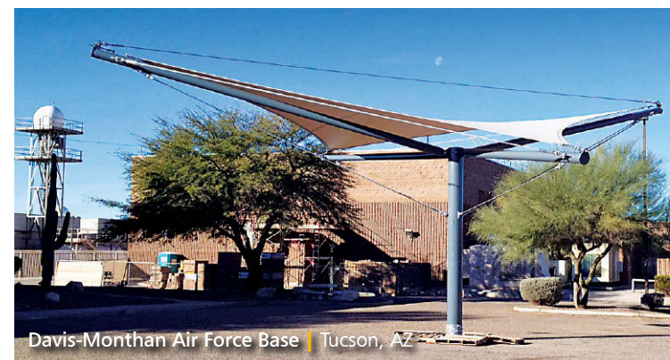
Davis-Monthan Air Force Base | Tucson, AZ