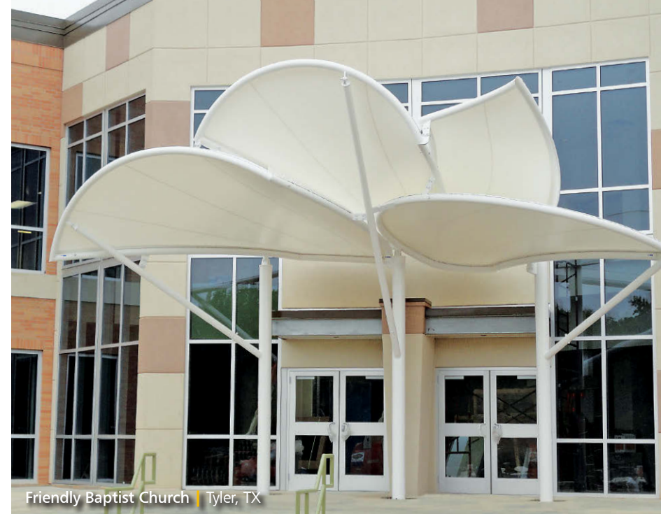
Friendly Baptist Church | Tyler, TX