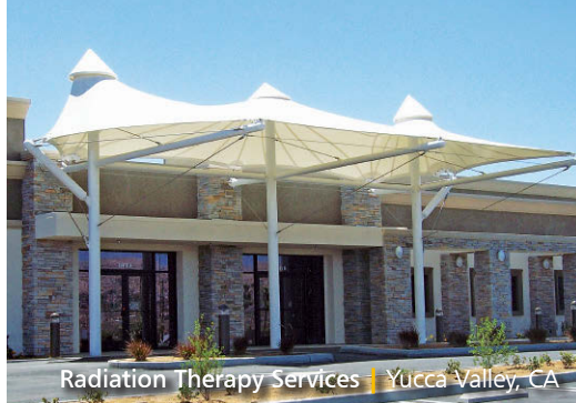
Radiation Therapy Services | Yucca Valley, CA