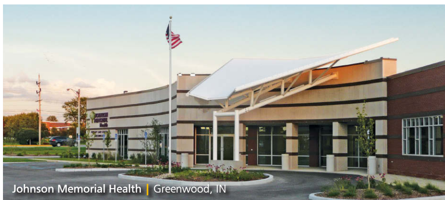
Johnson Memorial Health | Greenwood, IN