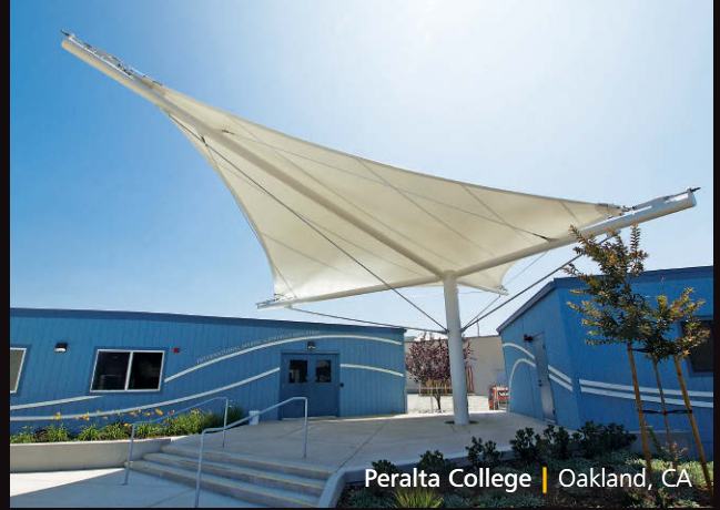
Peralta College | Oakland, CA

We specialize in design, manufacturing and installation of structurally complex and creatively challenging commercial, government and prototype design projects regardless of job size, scope of work or administrative demands. Eide welcomes any opportunity to partner with projects that require compliance with FAR, DIR and OATELS, Prevailing Wages, Apprenticeship Programs, and Union Labor Agreements.