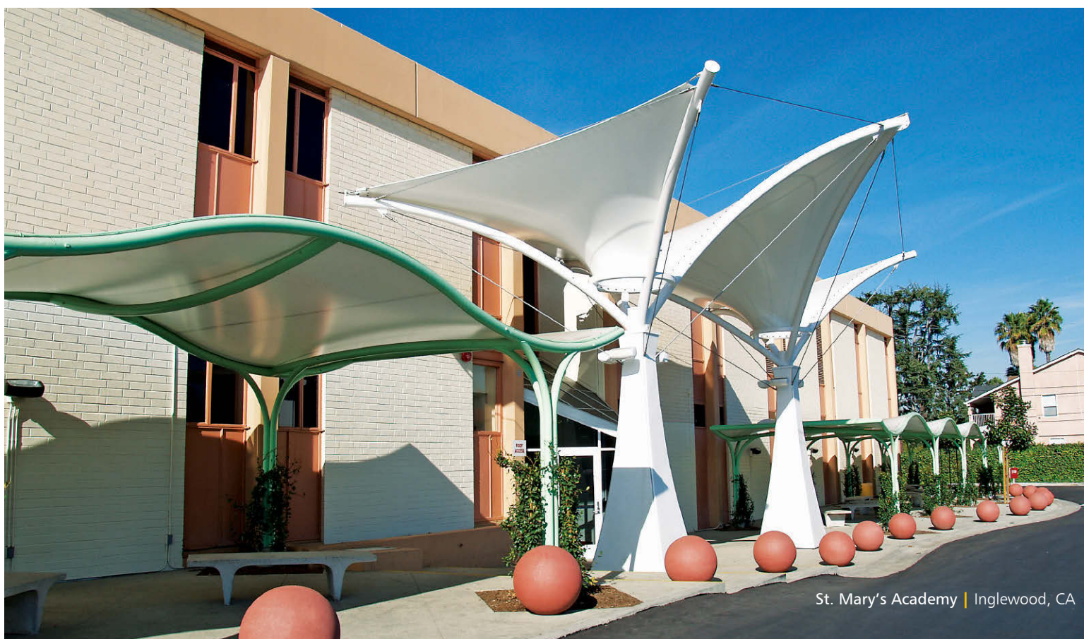
St. Mary's Academy | Inglewood, CA