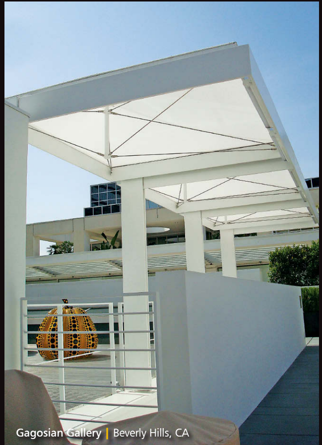
Gagosian Gallery | Beverly Hills, CA