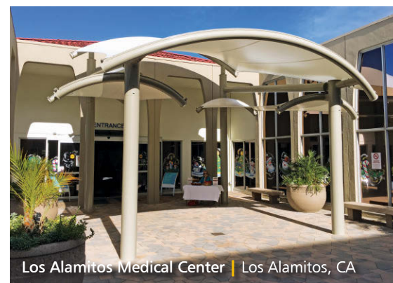
Los Alamitos Medical Center | Los Alamitos, CA