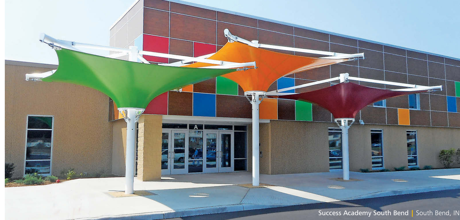
Success Academy South Bend | South Bend, IN